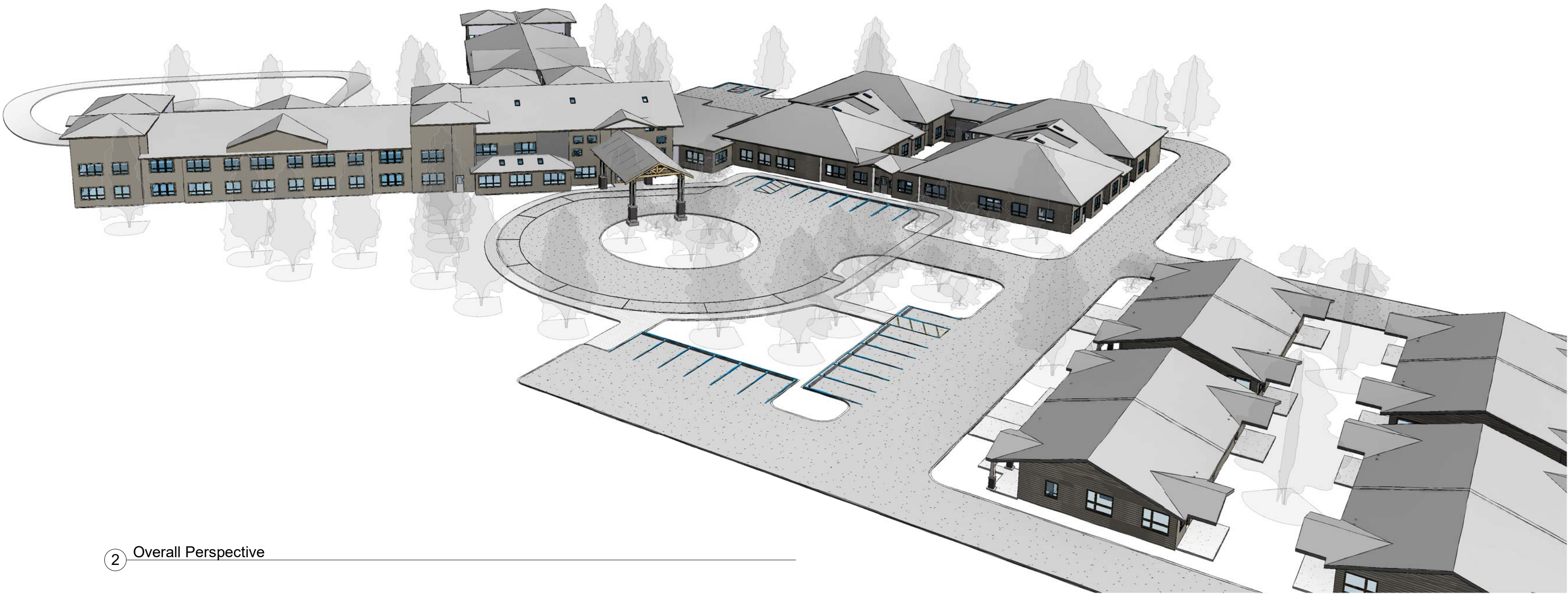
② Overall Perspective