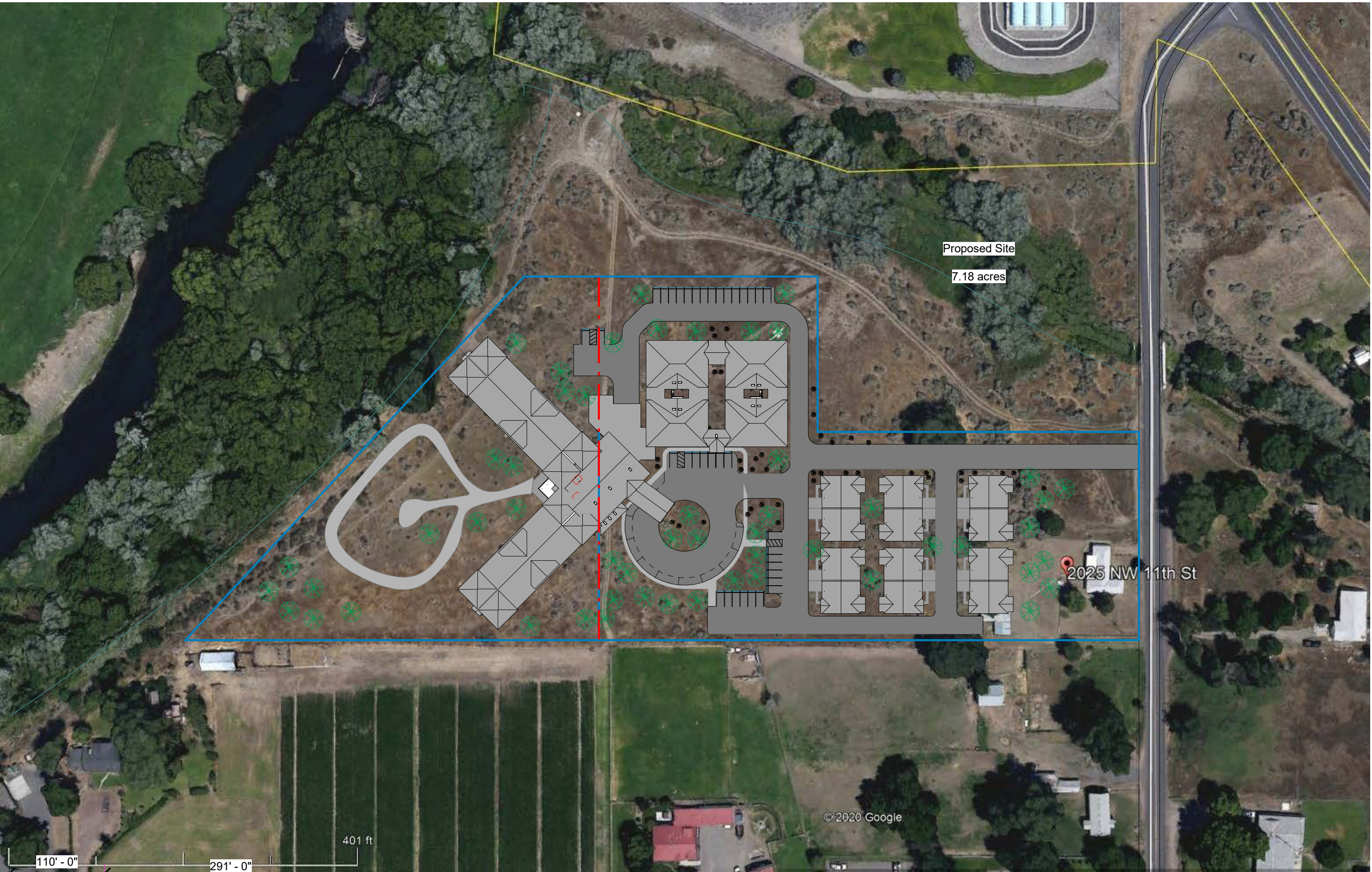
① -Site Aerial with Proposed Development 1" = 100'-0"